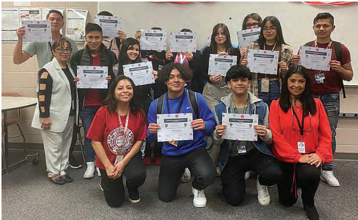
A group of students at Goshen High School celebrate their graduation after completing nine weeks of the Bienvenido program.

January - May, 2022 - NIHC offered the Bienvenido program to 35 high school 9 th graders and 20 middle school 7 th and 8 th graders in Elkhart Community Schools.